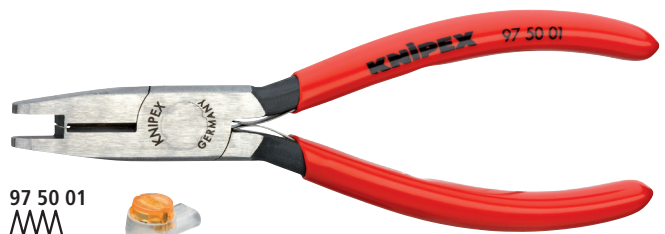
97 50 01